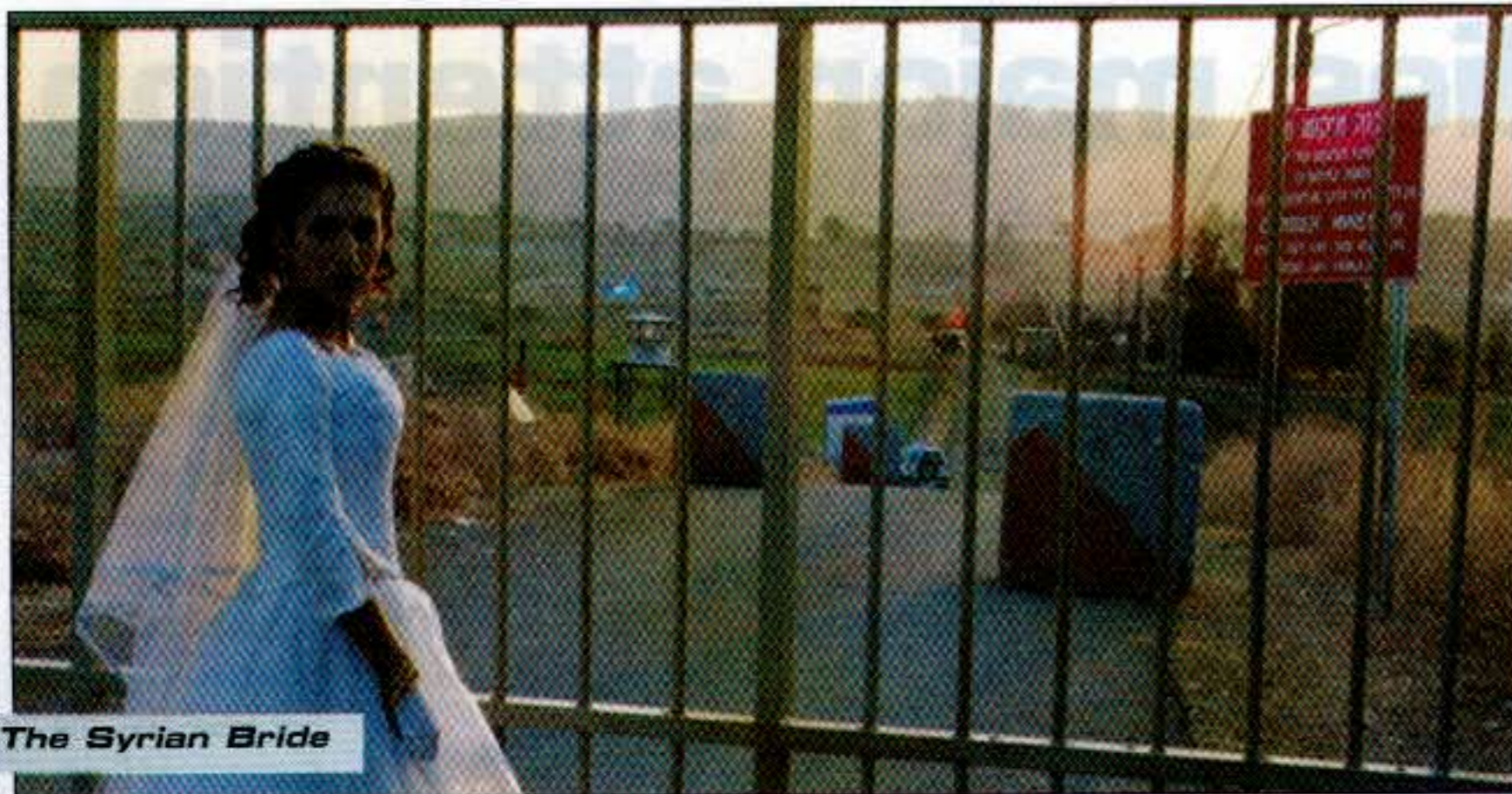
▶ The Syrian Bride