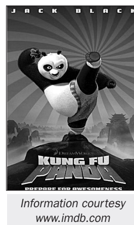
Information courtesy www.imdb.com