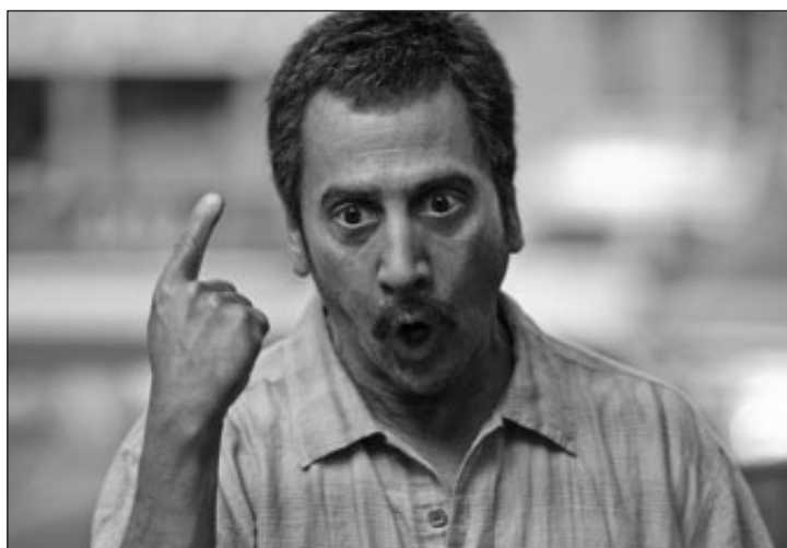
Rob Schneider stars in "You Don't Mess With the Zohan."