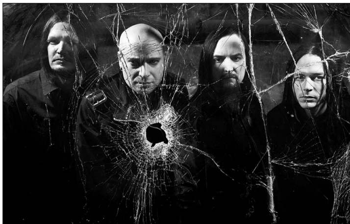
The Disturbed are, from left, guitarist Dan Donegan, singer David Draiman, drummer Mike Wengren and bassist John Moyer, who joined the other three in 2004.

April Wine: I Like to Rock: Live in London 1981 (Cherry Red DVD, 67 min.). One of Canada's most successful pop-rock bands on the international scene, the band was formed in late 1969 in Waverley, Nova Scotia. The original core consisted of brothers David Henman on guitar and Ritchie Henman on drums, joined by cousin Jim Henman on bass and Myles Goodwyn on vocals and guitar (Goodwyn wrote 11 of the 15 songs performed in this concert). Jim Clench replaced Jim Henman in 1971; and the Henman brothers left 1972-73 to be replaced by Gary Moffet on guitars and Jerry Mercer on