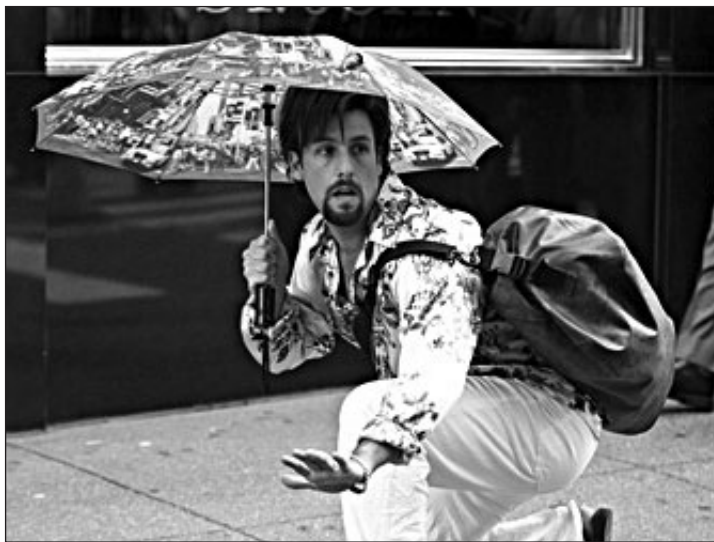
Adam Sandler stars in "You Don't Mess With the Zohan."

Turturro was great as Zohan's nemesis, and Sandler fans — and by that I mean fans of his most sophomoric and outrageous stuff — will probably love this movie. He is his usual over-the-top self in the film, and yes, he did make me laugh. His character is easily laughed at; Zohan's preference for feathery 80s hairdos and elderly women (the salon caters to old women and so, we