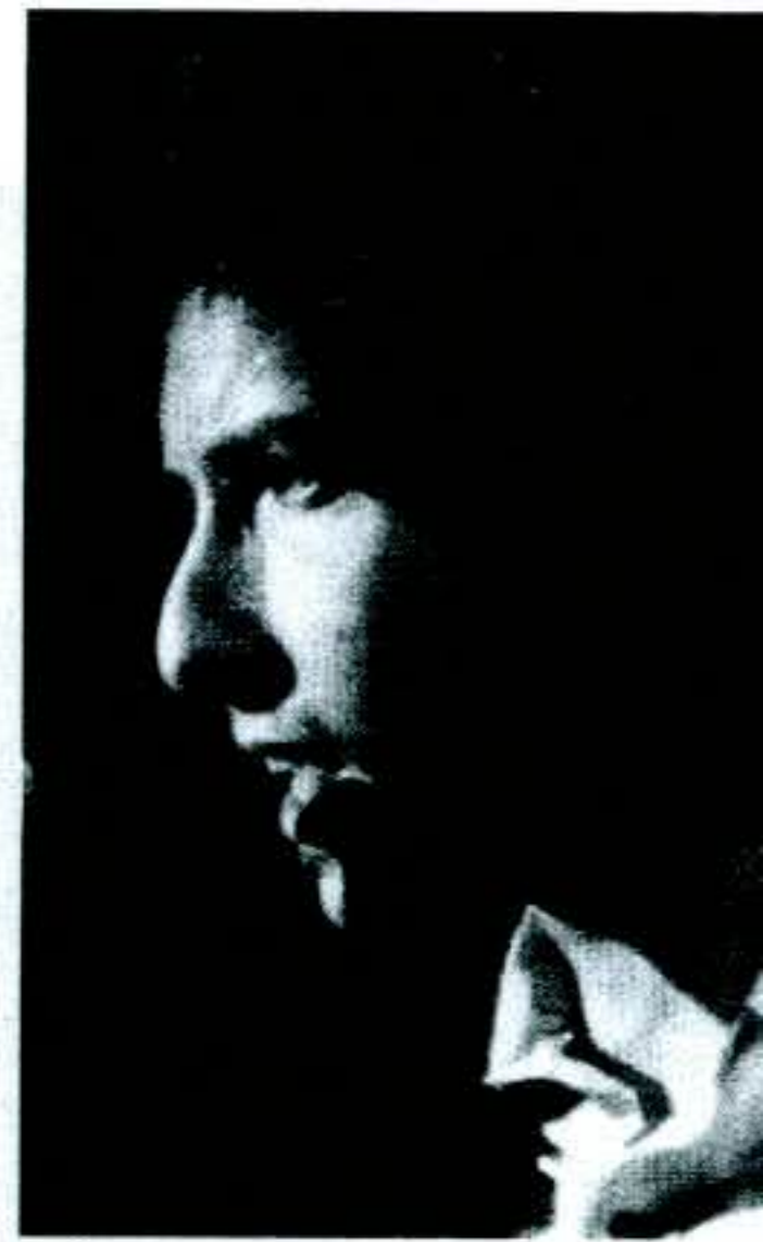
■ bob dylan

the country front, Sanctuary on March 8 struts out Johnny Cash! The Man, His World, His Music , a DVD of the long out-of-print documentary with guests June Carter Cash, Bob Dylan, Carl Perkins and The Carter Sisters . Also out that day, a 60-minute Jim Lauderdale DVD, In Concert: Ohne Filter (Music Video Distributors and Inakustik), taped in Baden Baden Germany in 1998 ■ Joni Mitchell is the subject of the special-edition DVD Painting with Words & Music/Woman of Heart & Mind . Just out on Eagle Rock, the set pairs an intimate 1998 sound-stage performance with a documentary on Mitchell’s career ■