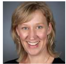
Sue Gleiter: Food writer ( http://connect.pennlive.com )