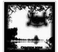
Aenygmist Creation Born Of Trauma