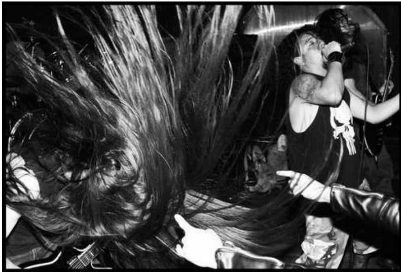
used for promotional purposes only.