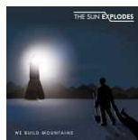
THE SUN EXPLODES – We Build Mountains