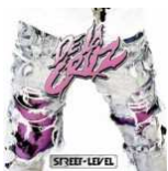
DE LA CRUZ – Street Level