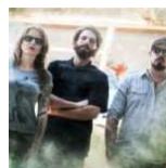
KYLESA Premiere New Psychedelic Music Video