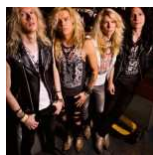
80's Rock Revivalists SANTA CRUZ Set To Release Debut Album