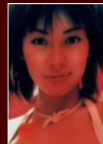
4. NINE SOULS