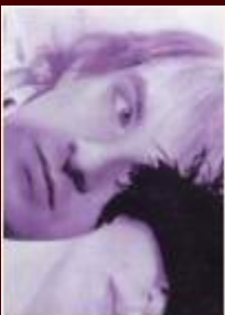
9. ELEVATOR MOVIE