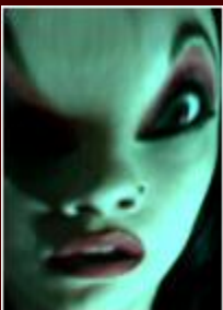
10. MAGIC RITUAL