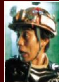
5. SAVE THE GREEN PLANET