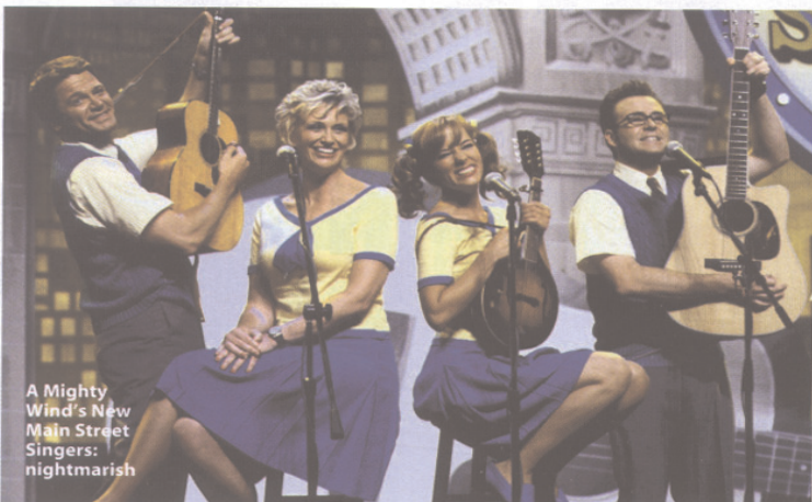
A Mighty Wind's New Main Street Singers: nightmarish