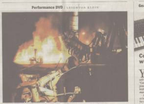
Survival Research Laboratories wreaks havoc in one of their robots-only performances.