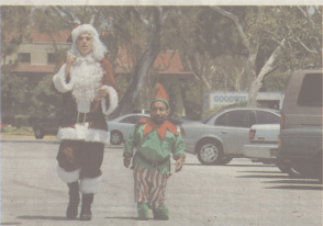
"HIS LAST" Billy Bob Thornton (left) and Tony Cox make the most of their holiday department store gig.