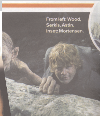
From left: Wood, Serkis, Astin. Inset: Mortensen.

Rolling Stone Magazine June 10, 2004 Page 103