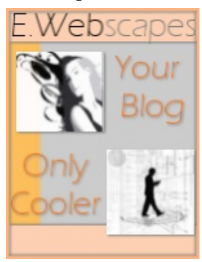
Got Blog? We've got you covered!