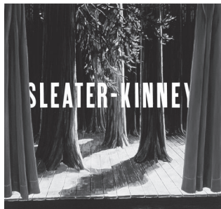
Sleater-Kinney The Woods (Sub Pop)