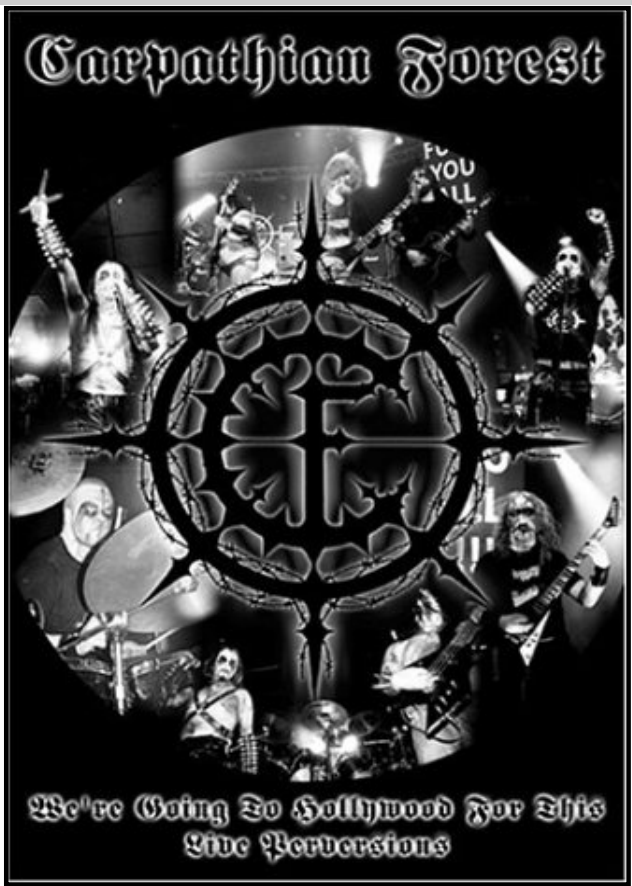
Carpathian Forest - We're Going To Hollywood For This: Live Pervervsions (Music Video Distributors) (buy it!)

The thing that has always set Carpathian Forest apart from the others is the fact that its particular style of Norwegian black metal is closer to hardcore punk rock or crossover than most. As all black metal bands are heavily influenced by classic Venom and early Mayhem, that influence is most felt with CF. It's that drunken, bloody, depraved and violent style of devil worshipping black metal that makes it