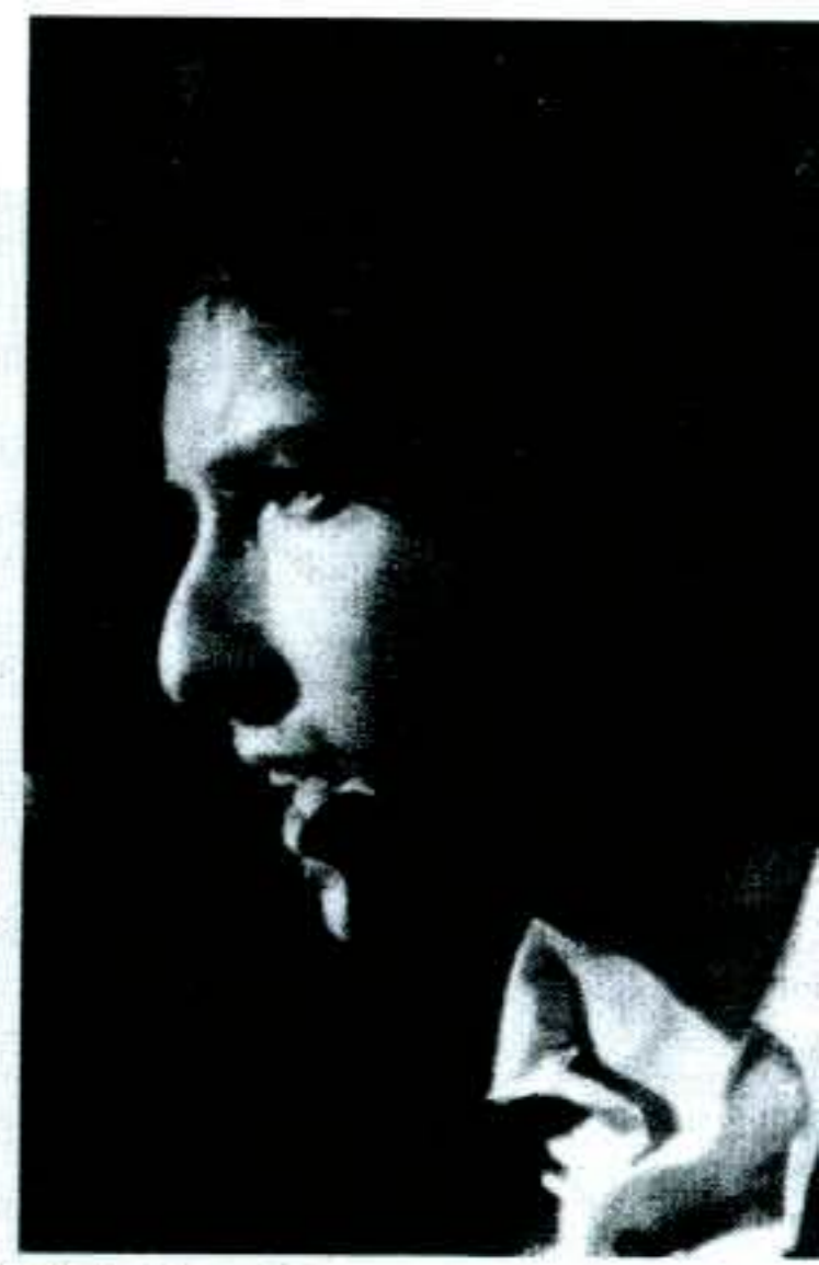
■ bob dylan