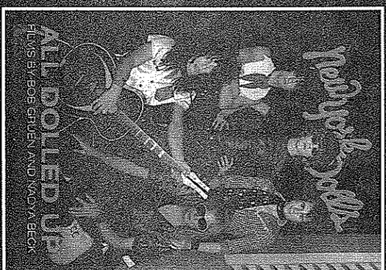
ALL BOLLEED UP PLUS S! B! B! BOG! U! E! AND W! D! A! B! E!