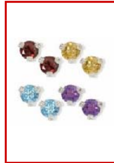
Elegante Gem And Absolute Cubic Zirconia Earrings