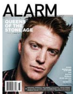
ALARM Magazine #27