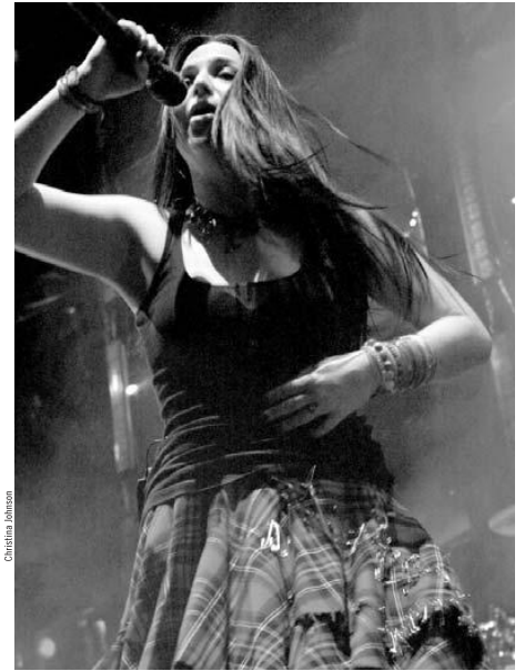
Amy Lee of Evanescence

Flyleaf's set would mark the shift towards