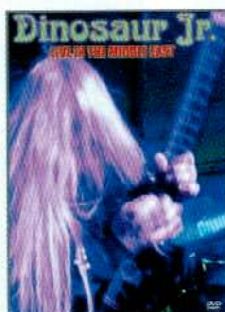
LIVE IN THE MIDDLE EAST DINOSAUR JR. IMAGE ENTERTAINMENT