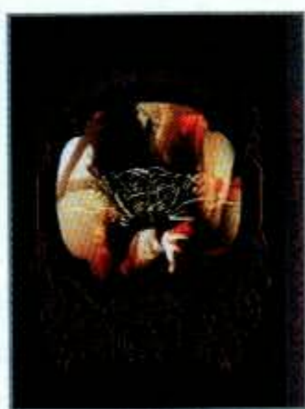
A DECADE ON THE THRONE: LIVE CHTHONIC TRA MUSIC