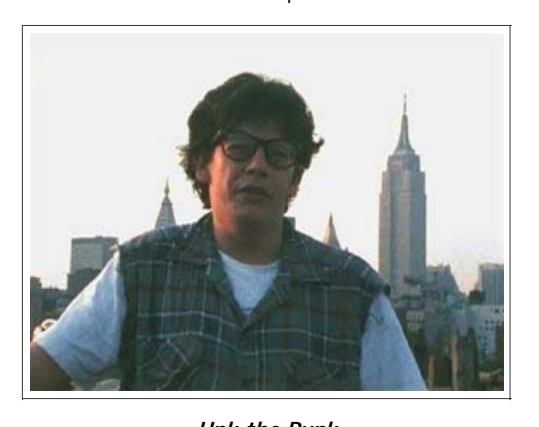
2 of 4 Unk the Punk 1/8/2008 9:45 AM

Hated is also possibly the best music related documentary ever produced. The documentary is obviously low budget and even amateurish. That doesn't matter considering the brilliance in the documented concert footage, interviews, and piss drinking. It's also great way to get a glimpse into the loyal followers of the fallen GG Allin Army. Fan Unk is a true American patriot and drinker of piss water.