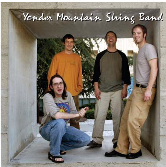
Yonder Mountain String Band