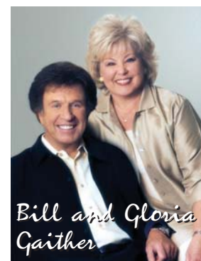
Bill and Gloria Gaither

Gospel music favorite Bill Gaither and his Homecoming