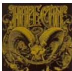
The Hope Conspiracy Death Knows Your Name