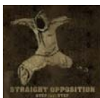
Straight Opposition Step by Step