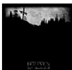
Ikuinen Kaamos The Forlorn