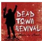
Dead Town Revival Hasta La Muerte