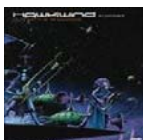
Hawkwind Out of the Shadows