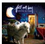
Fall Out Boy Infinity On High

# | A | B | C | D | E | F | G | H | I | J | K | L | M | N | O | P | Q | R | S | T | U | V | W | X | Y | Z | ÅÄÖ