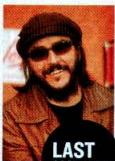
LAST GOOD MOVIE YOU SAW?

☆☆☆☆ While beloved singer-songwriter Leonard Cohen's music is known worldwide, his personal life has long been the subject of speculation. This feature-length portrait succeeds in sharing intimate details from the man himself. Inventive reworkings of his songs by super-fans U2, Beth Orton, Rufus Wainwright and others are interspersed between interviews.