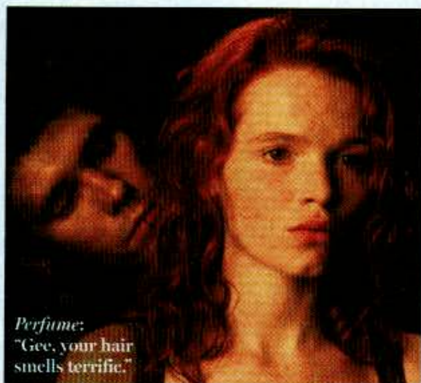
Perfume: "Gee, your hair smells terrific."