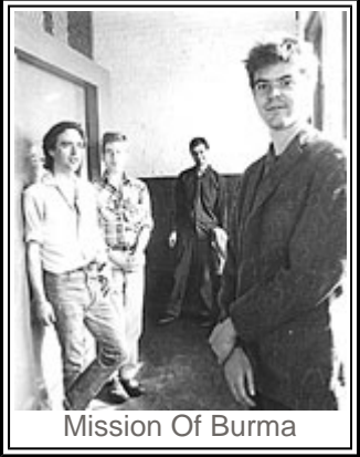
Mission Of Burma

Mission Of Burma's story is well-known to those who know their indie rock history, but the tale of the Boston band's demise after releasing one studio album in 1983 before making a remarkable comeback in 2002 will now be told on DVD.