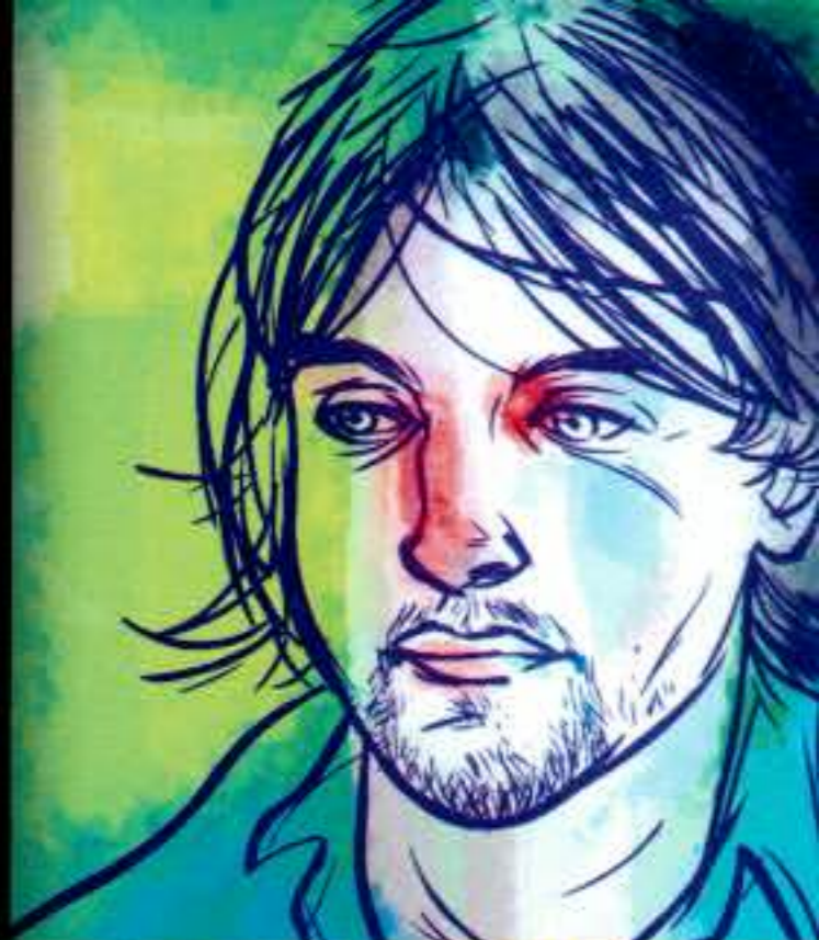
RICHARD LINKLATER & FAST FOOD NATION

TONY BENNETT JOANNA NEWSOM LINDSEY BUCKINGHAM