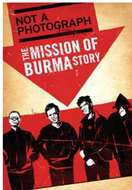
The Mission Of Burma Story / Thursday January 29th - 7pm USM Talbot Lecture Hall, Luther Bonney

On Sunday January 25th, the seminal post-punk band Mission of Burma are playing at the Space Gallery . For those of you not familiar with Mission of Burma they are considered one of the most influential bands of their generation. In the early 1980s they were a mainstay of the Boston punk and underground music scene. Unfortunately before they could make it much beyond the local legend status they had to disband due to medical issues. They did release a number of highly influential LPs and EPs that are still relevant today. In 2002 they toyed with the idea of a reunion. NOT A PHOTOGRAPH documents the resurrection of the seminal post-punk band Mission of Burma, as well as their humble beginnings in Boston. For a band deemed too ahead-of-their-time during their initial existence, NOT A PHOTOGRAPH follows Mission of Burmas 2002 reunion and their struggle to breathe new life into a tale thats already been written in rocks history books. NOT A PHOTOGRAPH also features early footage from 1979 through the early 80s, a time before compact discs and MTV, when rock & roll still had some tricks up its sleeve, and when a group of smart, young artist/musicians formed a band The New Yorker labeled the most criminally unsung band of the 1980s. they Thursday, January 29th, we present the film NOT A PHOTOGRAPH - The Mission of Burma Story