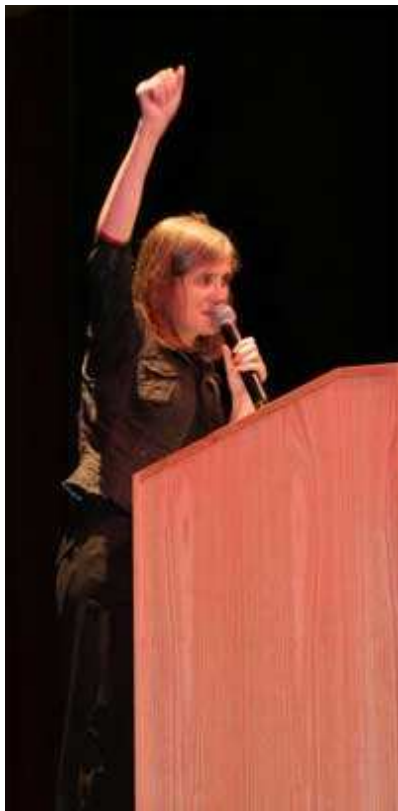
Democracy Now's Amy Goodman