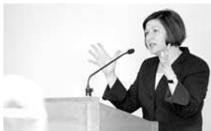
USM President Selma Botman