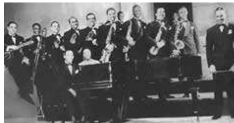
Oak City Band