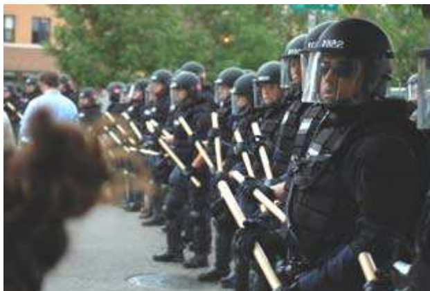
Police making a stand at the rally