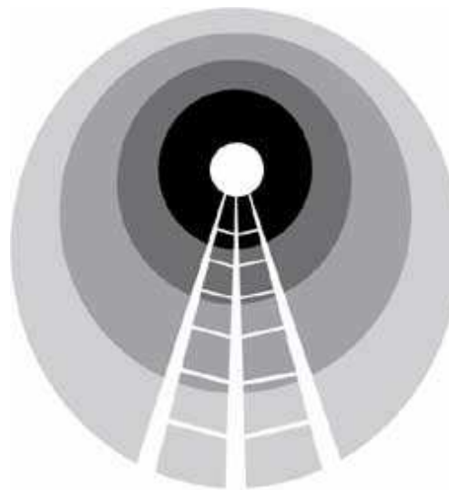
WMPG Power Upgrade moves forward

On December 17, 2008, USM Community Radio Station WMPG was awarded a construction permit by the FCC (Federal Communications Commission) to relocate its main 90.9 FM transmitter and antenna from Gorham to Blackstrap Hill in Westbrook and increase power from 1.11 kW to 4.5 kW. The power increase and antenna relocation will dramatically increase the number of potential listeners in the station's signal range, from 35,000 to 185,000. To complete this project WMPG will immediately begin a major capitol campaign. The total costs for the project (including costs already incurred in the application process) will be $200,000 and will include replacing the current transmitter and all associated transmission equipment. The FCC has given WMPG three years to finish the upgrade; the station intends to complete it within two.