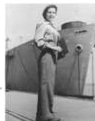
Woman Ship Builder

Homefront Veterans Oral History Project Audio here.