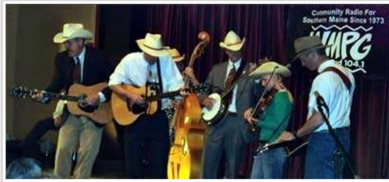
The Grassholes at the Bluegrass Spectacular

Spectacular was MC'd by WMPG's own Blizzard Bob , host of the Wednesday morning "Blue Country" show. All Proceeds from the Bluegrass Spectacular benefited WMPG. Thanks go out to all the bands - you can visit their web pages at myspace.com/thegrassholes or jerksofgrass.com and the The Stowaways .