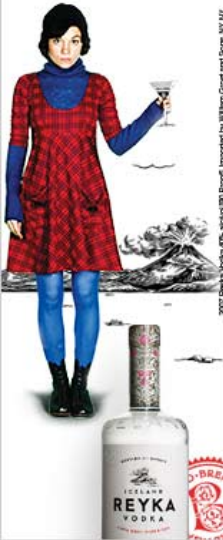
© 2007 Reyka Vodka Co. and/or its agents. Imported by William Grant & Sons, NY, NY.

IN ICELAND THE ONLY FLAVORED VODKA WE MAKE IS VODKA FLAVORED VODKA.