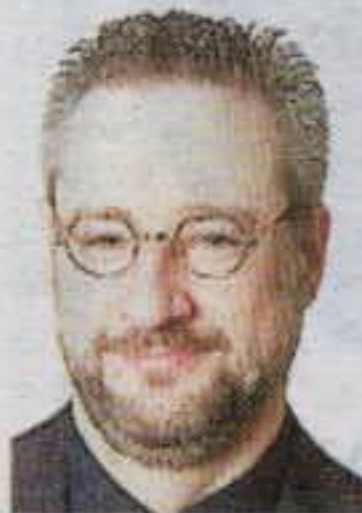
LINDSAY PLANER Music

This overdue offering is the first in-depth documentary to focus solely on the words and music of Tim Buckley — arguably one of the most underappreciated talents of the latter 20th Century. The main feature includes modern conversations with frequent Buckley collaborators