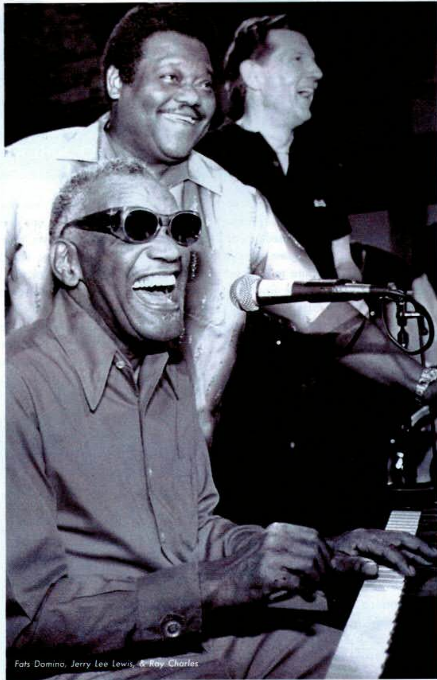
Fats Domino, Jerry Lee Lewis, & Ray Charles