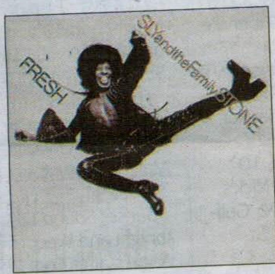
"Fresh," Sly & The Family Stone, artist (Epic/Legacy, ★★★½)

"Family Affair" was the biggest hit, and the only consistently catchy one here.