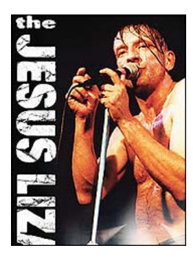
The Jesus Lizard