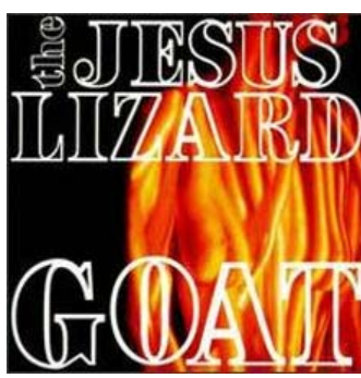
The Jesus Lizard's first three albums are all classics: "Head" (1990), "Goat" (1991), and "Liar" (1992)