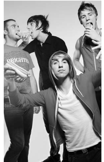
(l to r) Rian Dawson, Jack Barakat, Alex Gaskarth and Zack Merrick of All Time Low

If the exponentially growing number of kids who learned the words to "Dear Maria, Count Me In" weeks before So Wrong had even unofficially leaked are any indication, Gaskarth hasn't got much to worry about. And with a solidly booked tour