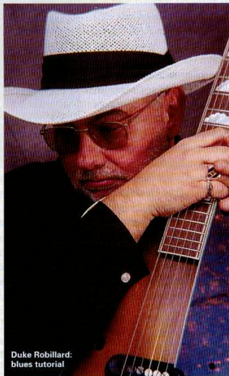
Duke Robillard: blues tutorial

House extolling the virtues of "real old blues" that makes one believe in music as poetry.