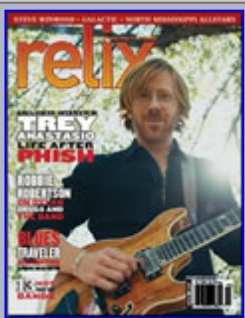
Trey Anastasio: Life After Phish