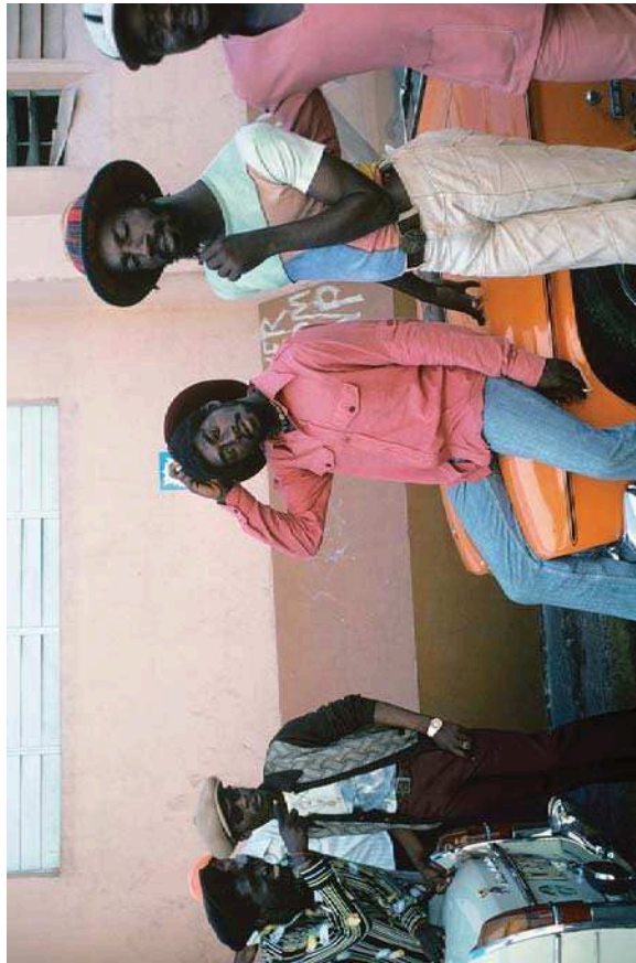
"This was known as 'Vibes' Rest,' was around the corner from Randy's Record Shop. Musicians, singers, and would-be singers would lurk about listening to the newest 45s 9pm, waiting to be called in for a session."

How did Jamaica feel to someone from Andros and New York? Really exotic. An unusual experience.