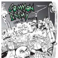
COMMON ENEMY Living the Dream?