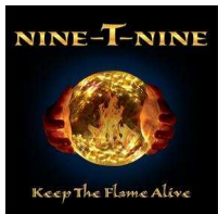
NINE-T-NINE Keep The Flame Alive