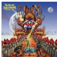
THE BLACK DAHLIA MURDER Deflorate