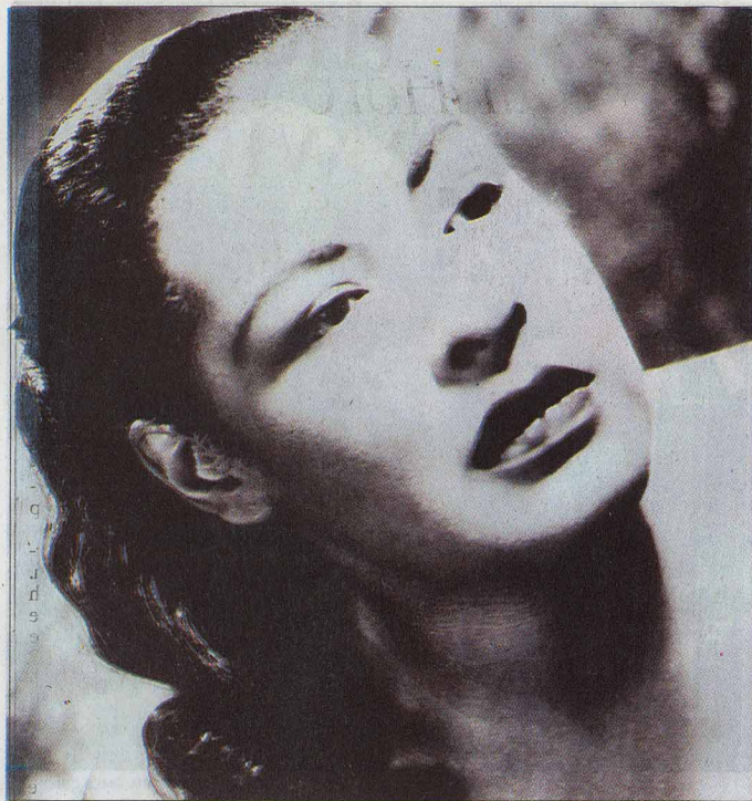
Billie Holiday is featured on Volume 1 of the new DVD Jazz Voice .