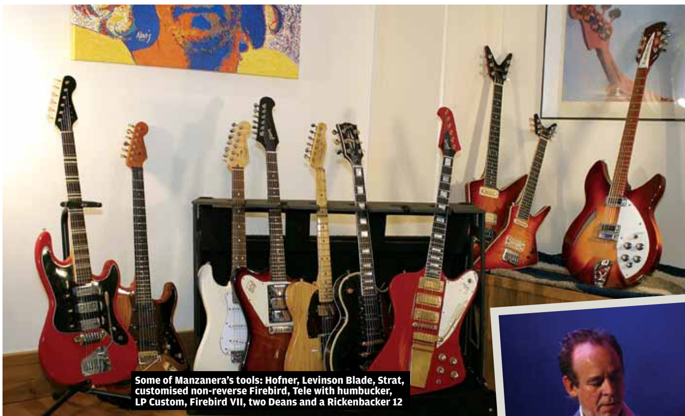
Some of Manzanera's tools: Hofner, Levinson Blade, Strat, customised non-reverse Firebird, Tele with humbucker, LP Custom, Firebird VII, two Deans and a Rickenbacker 12