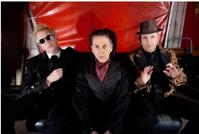
Information Society Facebook page