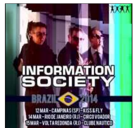
Information Society Brazil Tour 2014