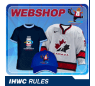
CHAMPIONSHIP RULES IIHF WORLD RANKING

KEY MATCHUP IN THE SPOTLIGHT POWER RANKINGS Q & A WITH A STAR IHWC GLOBAL EXPERTS