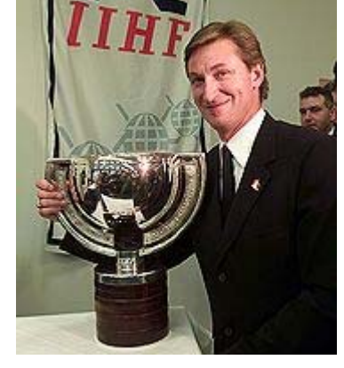
Relive Wayne Gretzky's 21-point performance in the 1987 Canada Cup on DVD