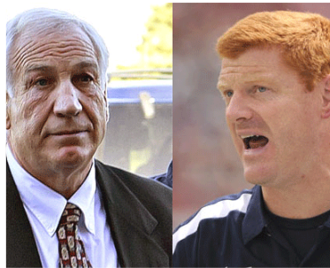
McQueary: 'I did stop it'