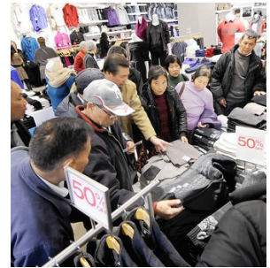
Why wait for Black Frid