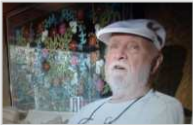
The great Richard Matheson.