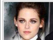
Kristen Stewart Booted From Snow White Sequel