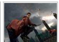
'Harry Potter' Stars are Reprising Their Roles!!