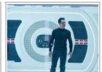
Star Trek Into Darkness: Plot Secrets Revealed?