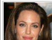
Angelina Jolie Debuts Her Maleficent Look