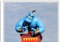
25 Things You Never Knew About Aladdin