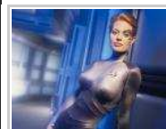
The 8 Coolest Cyborgs