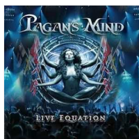
PAGAN'S MIND Live Equation (DVD)