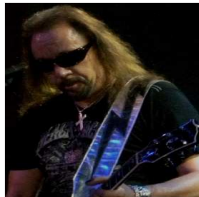
ACE FREHLEY (Live) Debaser Medis, Stockholm 30 Nov