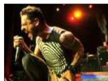
Fat Tour 2009 (5/28/09)