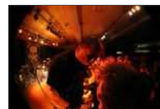
Frostbite Tour (03/24/06)