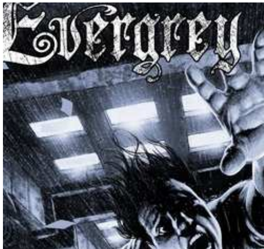
Evergrey - The Glorious Collision