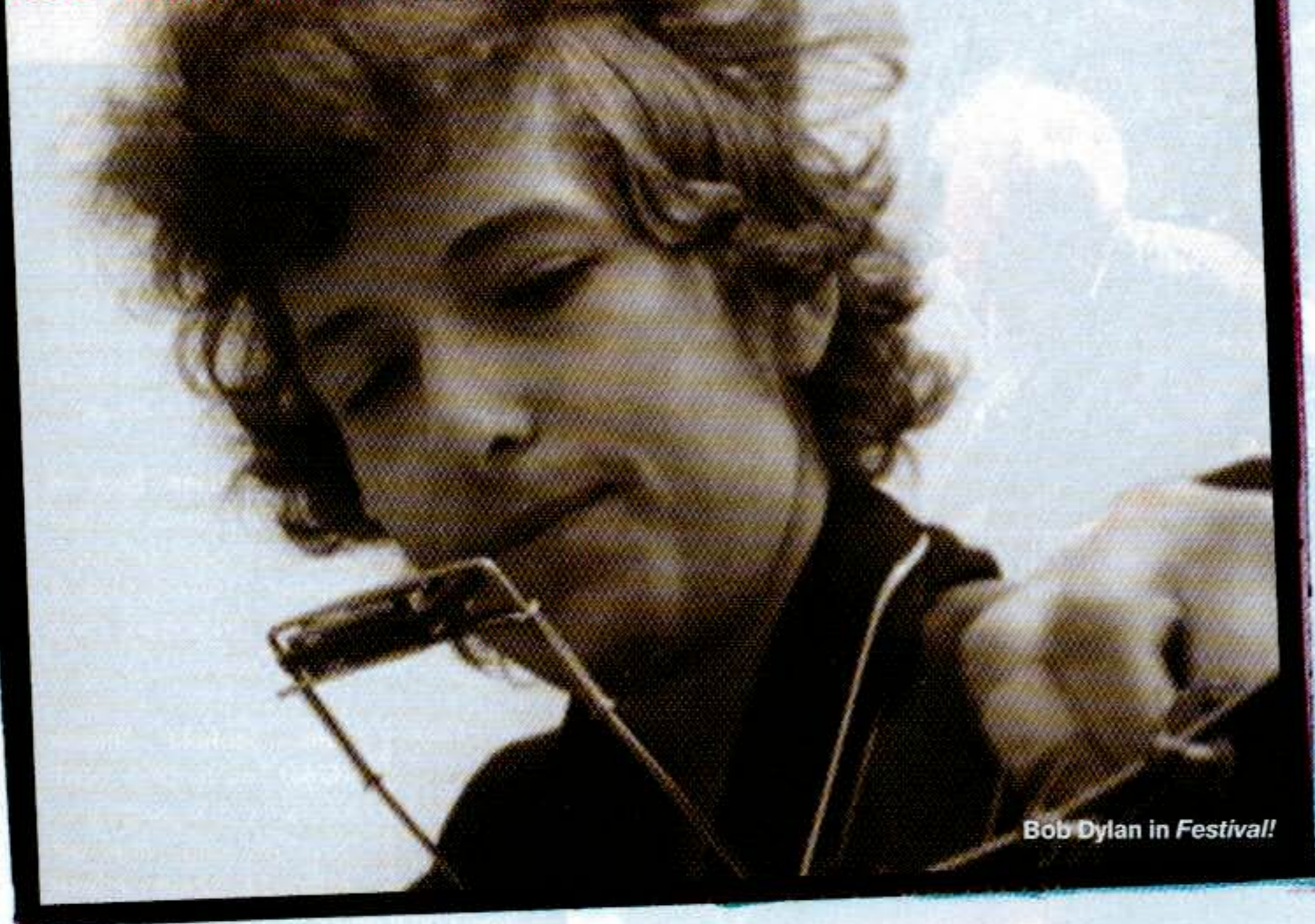
Bob Dylan in Festival!